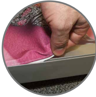
Channel insertion of rubber silicon edging