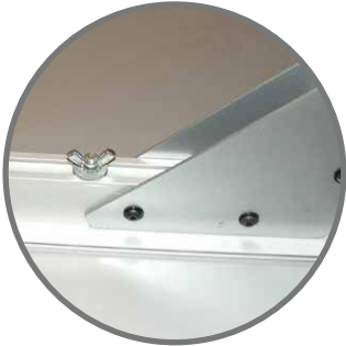
Simple and sturdy construction