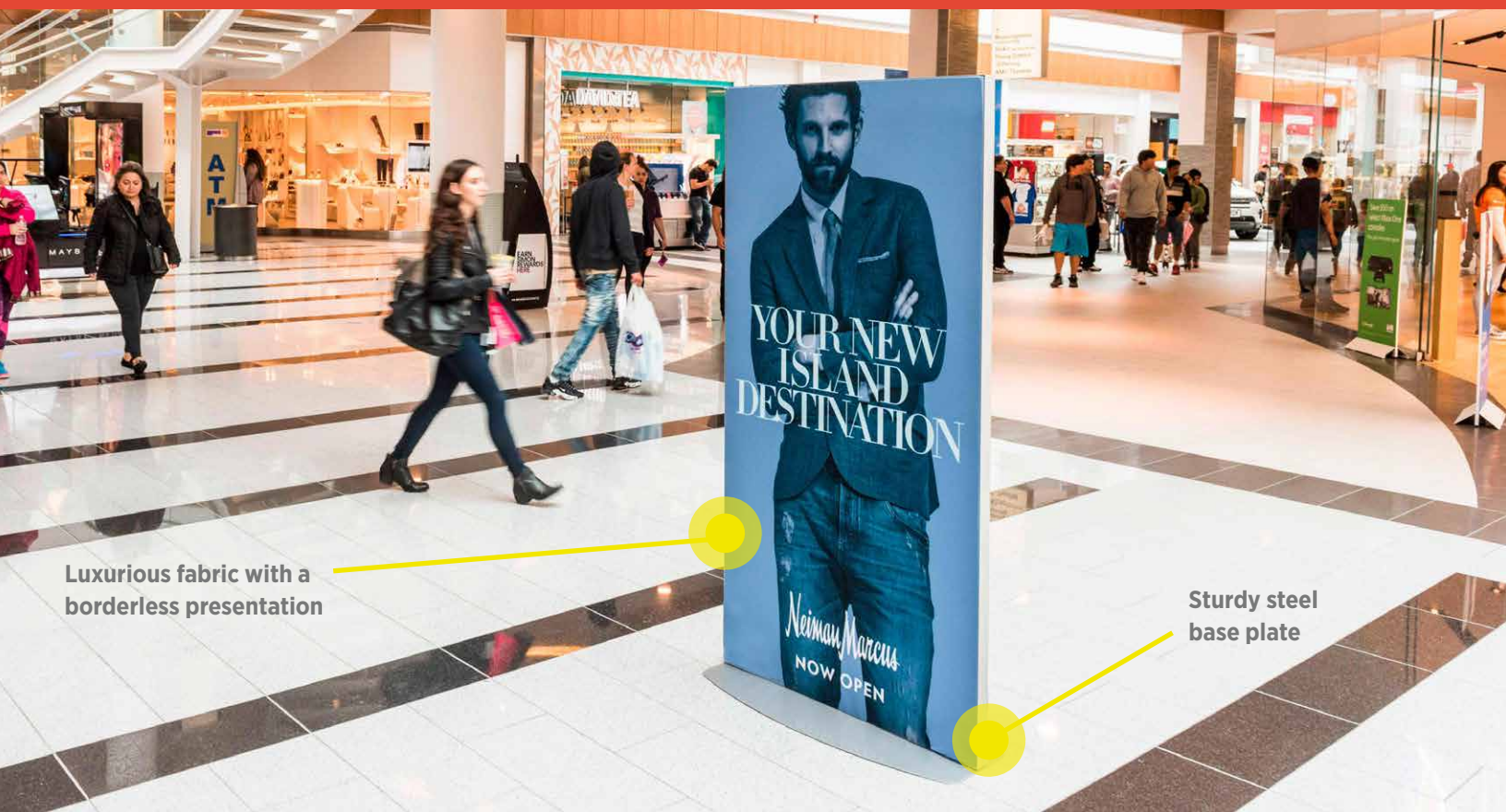
Luxurious fabric with a borderless presentation