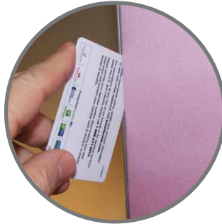
Creates seamless look by using typical credit card along edges