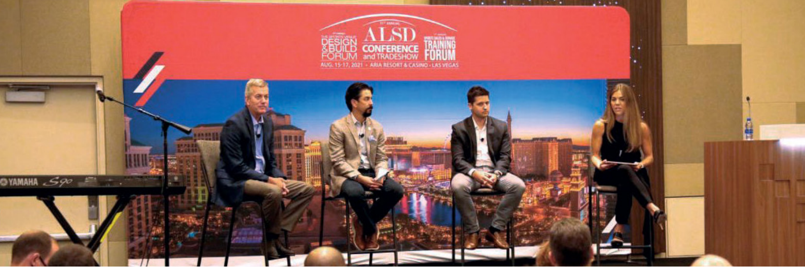
8' H x 15' W Event Backdrop