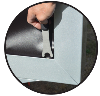
OVIO clips push into position