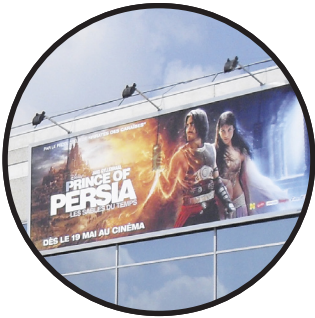
OVIO frames allow for many versatile applications