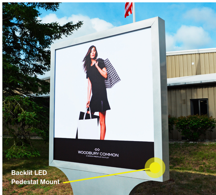
Backlit LED Pedestal Mount