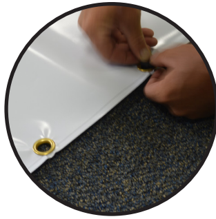
Grommets are spaced evenly every 16"