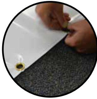
Grommets are spaced evenly every 16"