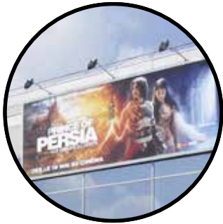
OVIO frames allow for many versatile applications