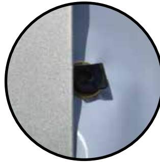
OVIO clips fasten into the grommets