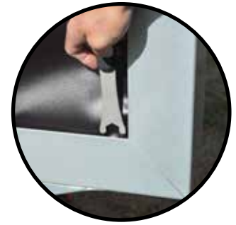
OVIO clips push into position