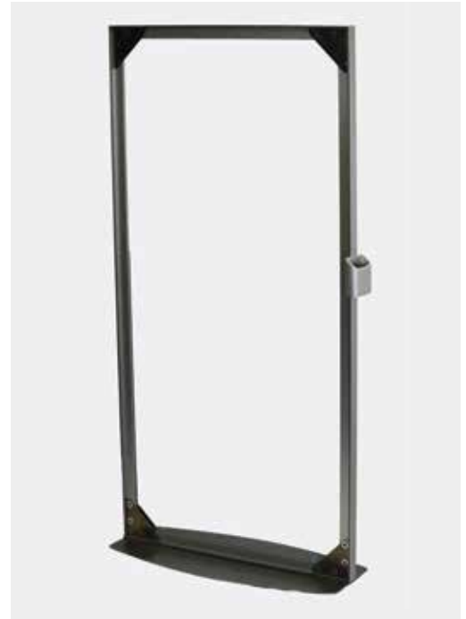
Shown with optional Attaché™ brochure holder

Disassembly Recommendation: Remove the frame from the base, leaving the frame intact for easy storage. Remember to keep hardware with the frame.